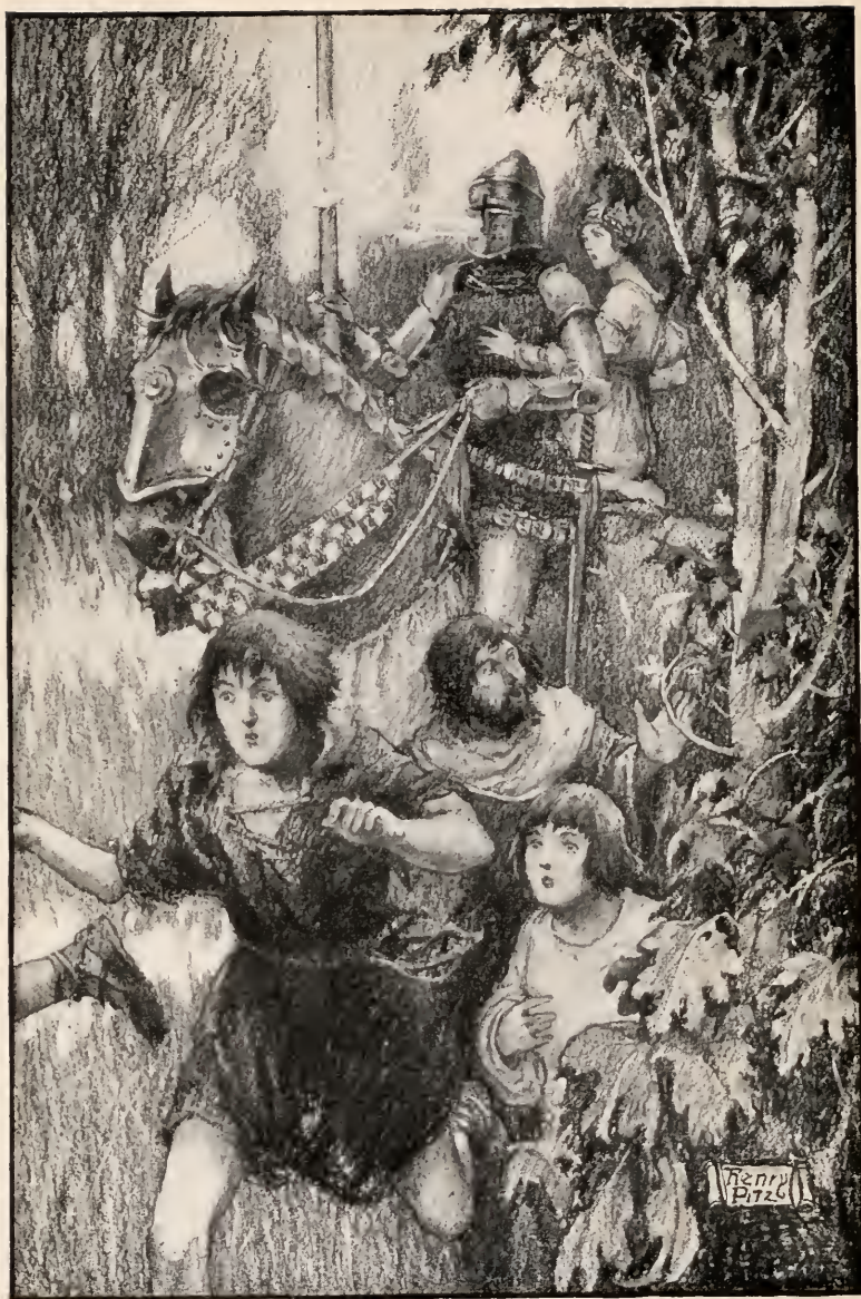
WHEN THE FIRST BLAST OF SMOKE SHOT OUT THROUGH THE BARS OF MY HELMET, ALL THOSE PEOPLE BROKE FOR THE WOODS,